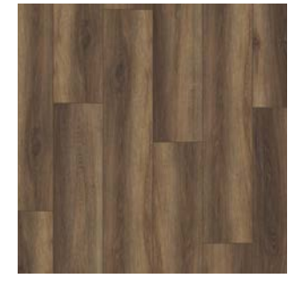
Chateau 3 colors