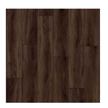
Boutique 2 colors