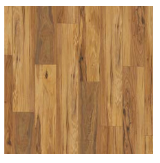
Adirondack 2 colors