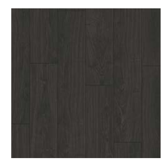
Tribeca 2 colors