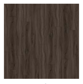
Loft 2 colors