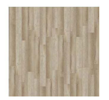
Cottage 1 color