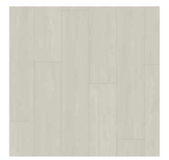
Outer Banks 3 colors